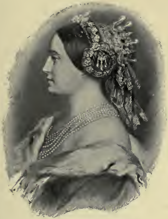
THE PRINCESS MATHILDE BONAPARTE. (After Giraud.)